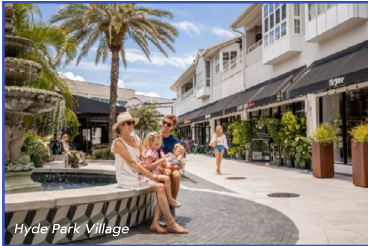
Hyde Park Village